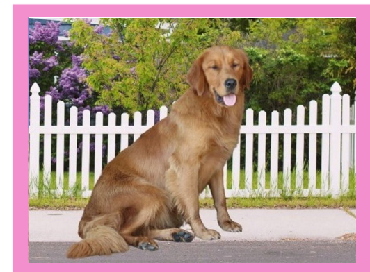
Winifred (Golden Retriever)