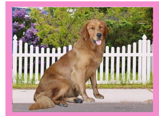
Winifred (Golden Retriever)