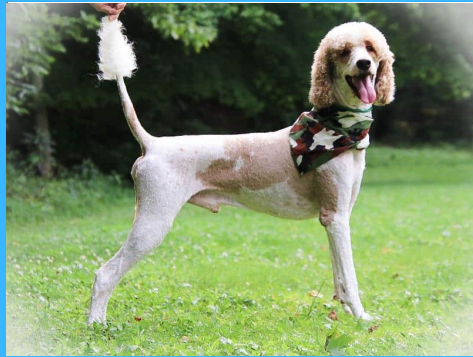
Sergeant (Poodle Standard)