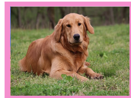
Makita (Poodle Standard)