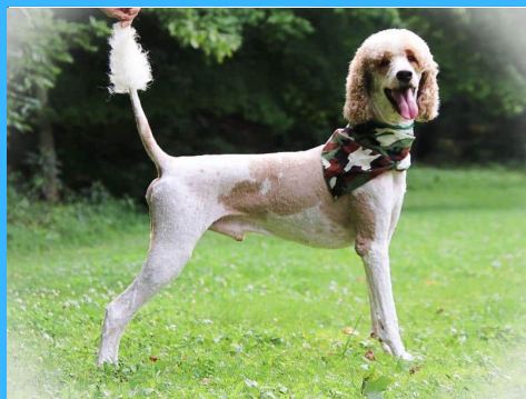
Sergeant (Poodle Standard)