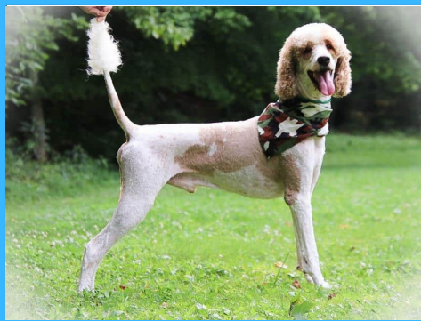
Sergeant (Poodle Standard)