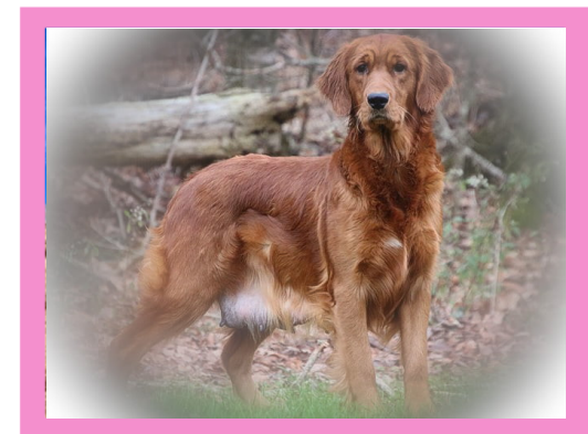
Katie (Golden Retriever)