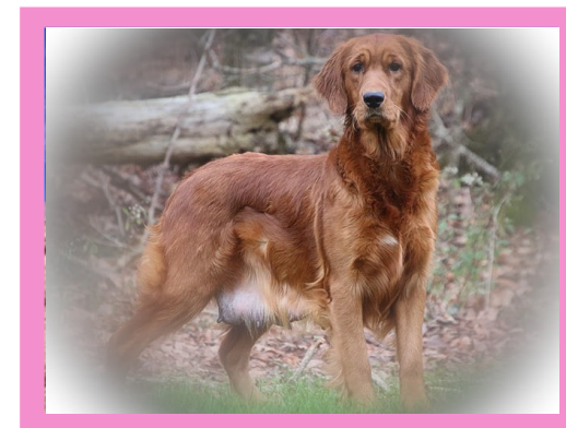
Katie (Golden Retriever)