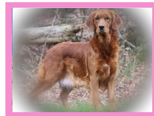
Katie (Golden Retriever)