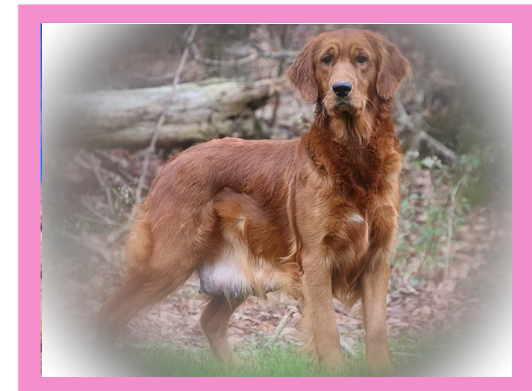
Katie (Golden Retriever)