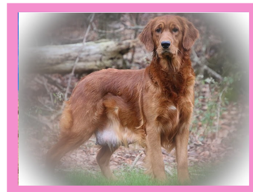
Katie (Golden Retriever)