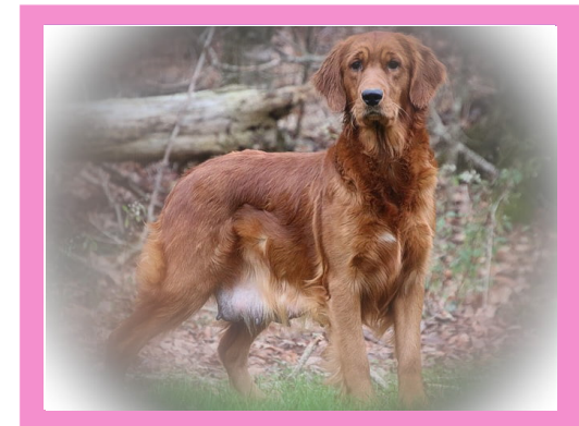
Katie (Golden Retriever)