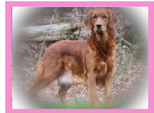
Katie (Golden Retriever)