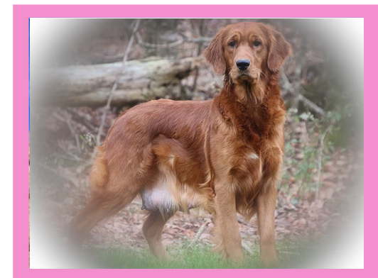
Katie (Golden Retriever)