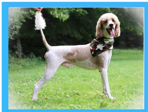
Sergeant (Poodle Standard)