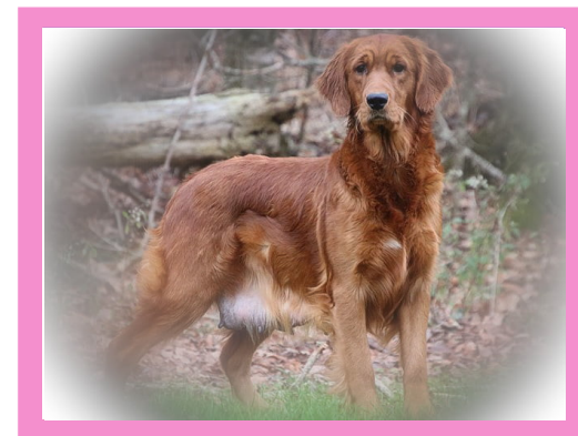
Katie (Golden Retriever)