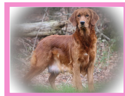
Katie (Golden Retriever)