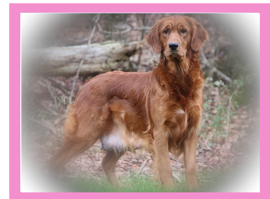
Katie (Golden Retriever)