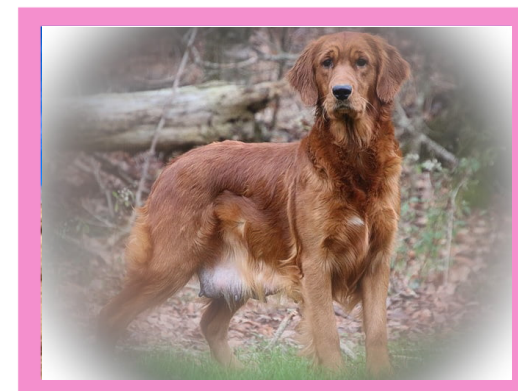
Katie (Golden Retriever)