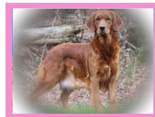
Katie (Golden Retriever)