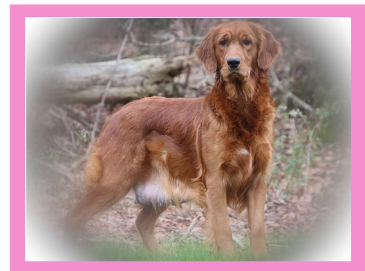
Katie (Golden Retriever)