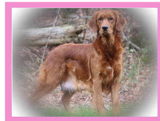
Katie (Golden Retriever)