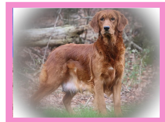
Katie (Golden Retriever)