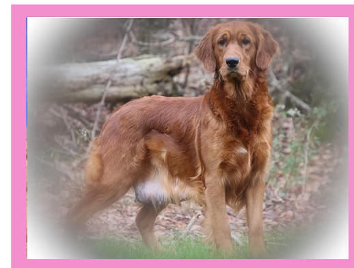
Katie (Golden Retriever)