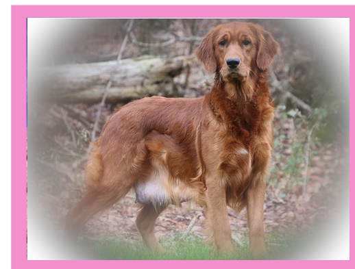
Katie (Golden Retriever)