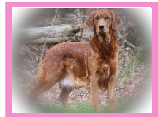
Katie (Golden Retriever)