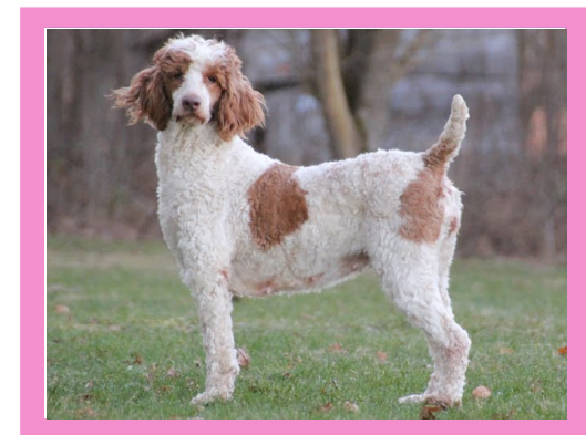
Jewels (Poodle Standard)